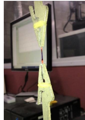
Figure 3: Clamping grip mechanism; inclusion of unmarked material not in original gauge length