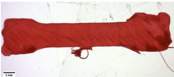
Figure 1: Microscope view for material fill validation