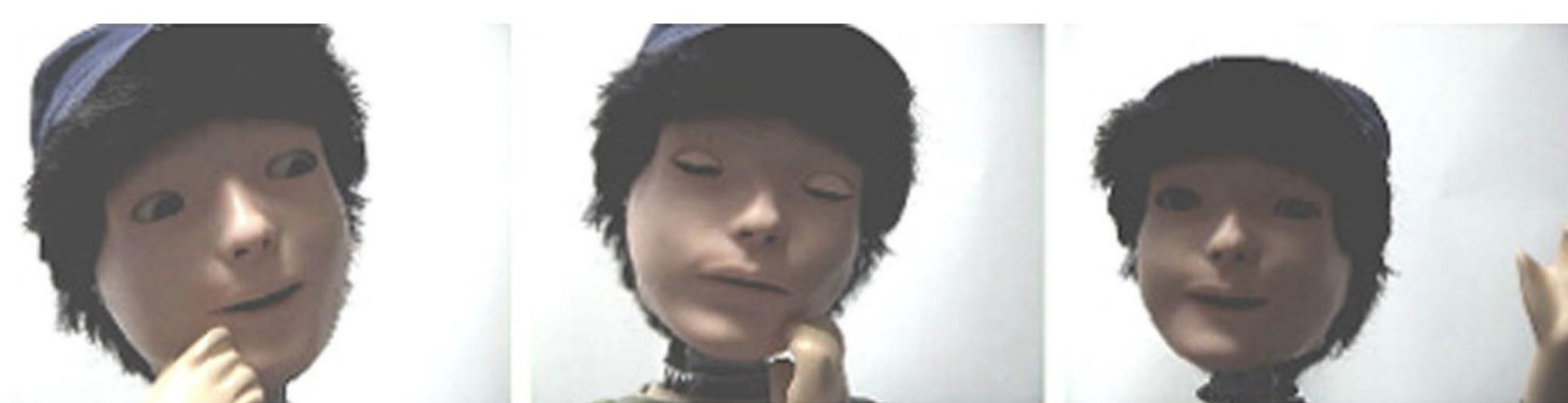
Figure 3: Kaspar robot showing a range of emotions

Integrating eye tracking into more social settings can also allow for more genuine insight into a child's mental state, especially when joined by a human supervisor or observer. Kaspar, a humanoid child robot, was employed successfully as a tool in a nursery for children with autism. Teachers found children could connect with it more comfortably than face-to-face lessons (Syrdal et al. , 2020). Utilizing eye tracking in therapy robots like Kaspar can help maintain a more casual environment than other eye tracking studies while getting more natural gaze patterns from children.